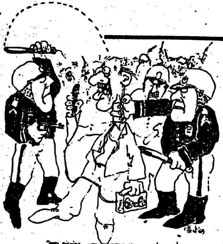
AND BEING OFF BEATLY, THAT ON THE SPOT REPORTER ON CAMPUS